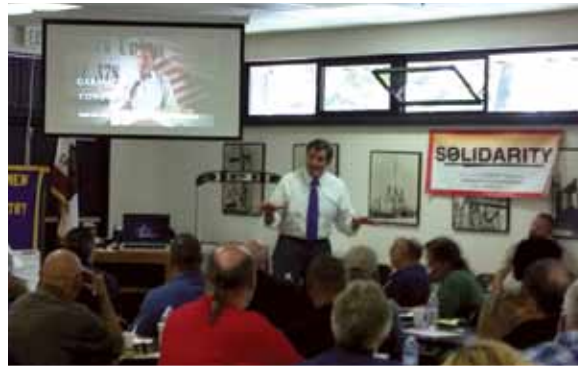
Congressman John Garamendi attends Local 378’s No on Prop 32 campaign school.