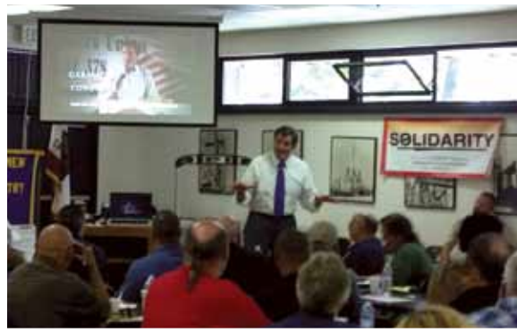
Congressman John Garamendi attends Local 378's No on Prop 32 campaign school.